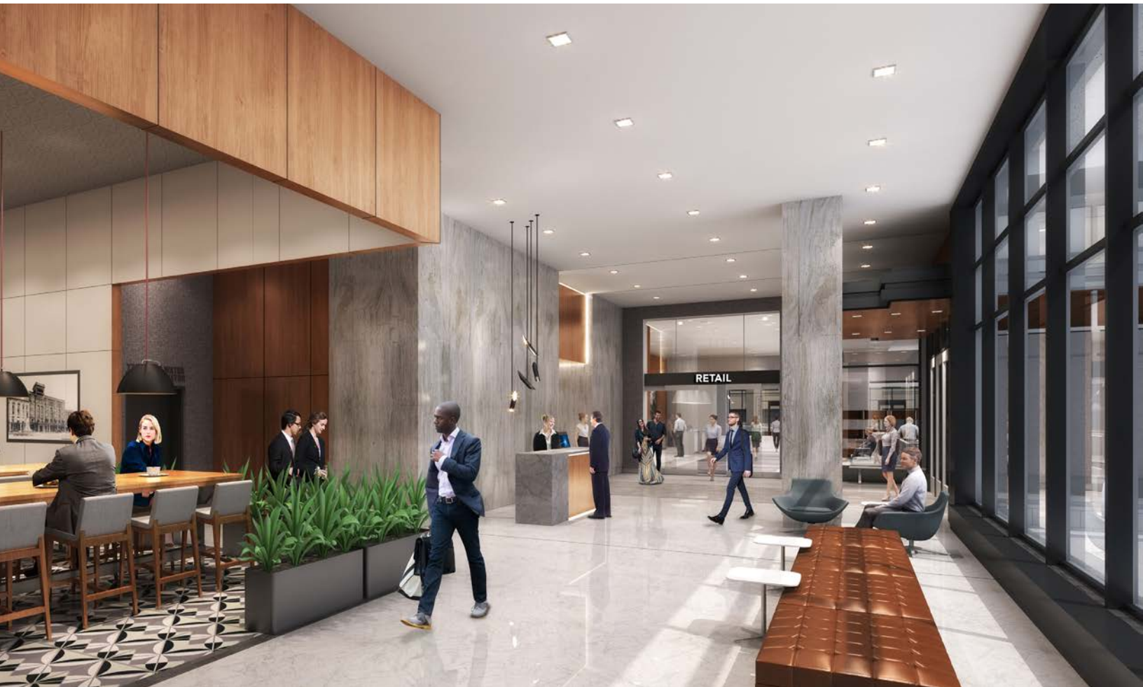
Lobby and Retail