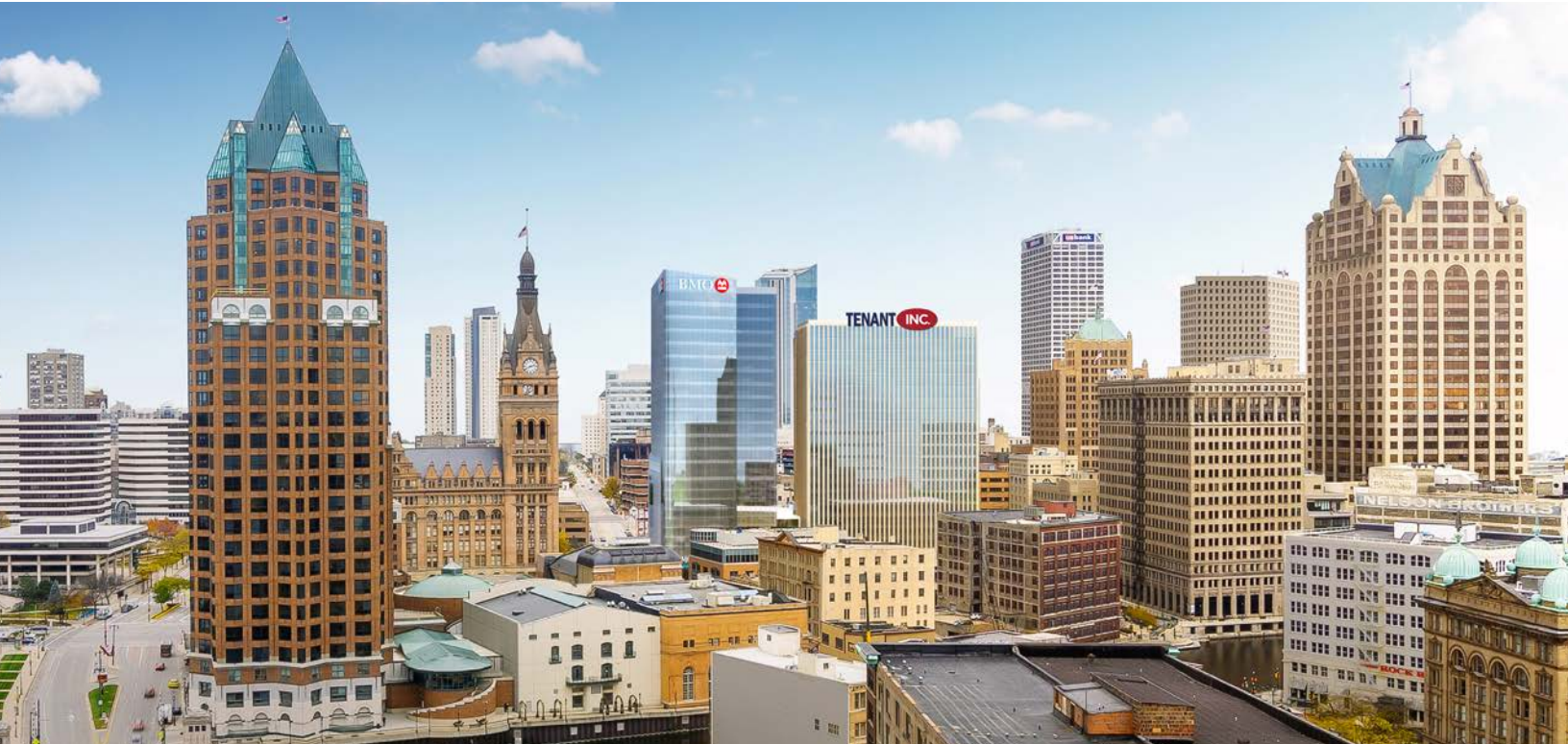
View East from Hyatt Regency