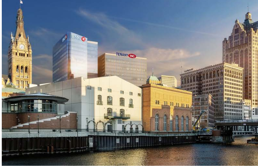
View East from Milwaukee River Walk

Featuring over 700,000 square feet of complementary Class A uses, 770 North and BMO Tower create a unique, integrated campus offering the preeminent corporate environment in Milwaukee. Office occupiers benefit from the availability of on-site retail as well as a myriad of neighborhood amenities.