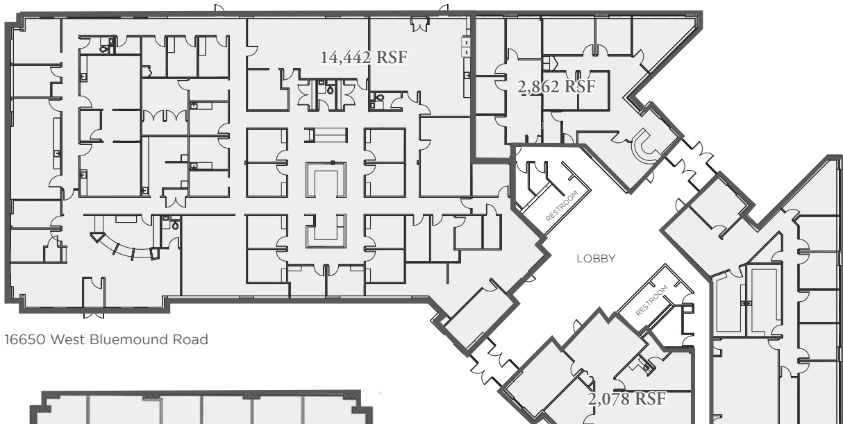
16650 West Bluemound Road